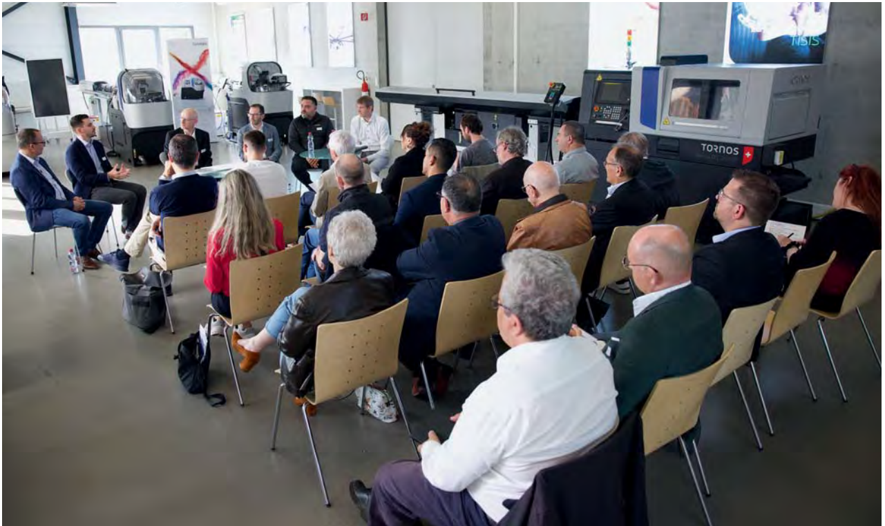
Tornos round table at the AFDT press days